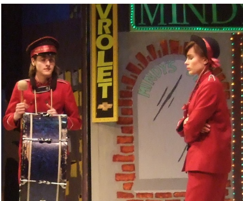
Guys & Dolls - March 2010

There were a lot of happy parents last month as they received the letters confirming their sons' places at the College for the next academic year (2010-2011). There were, however, twice as many unhappy ones. Once again, there were more than three times as many applicants as there were places available. There is also an application process for the sixth-form and this, too, is over-subscribed. These are highly positive indicators of the College's well-founded reputation as a leading state school for Catholic children.