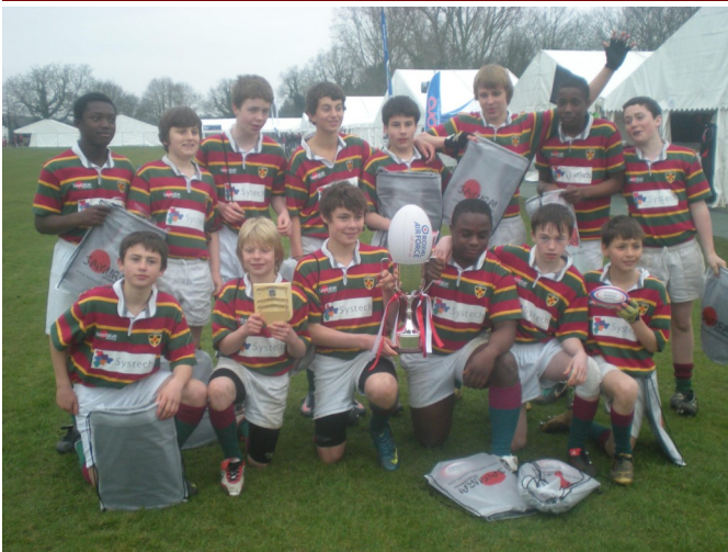
Under 13 Rugby Sevens National Champions

At the time of writing, most members and staff had made it back in time for the start of the new term. Thankfully only a few had been left stranded by the after effects of the volcanic eruption in Iceland. Interestingly enough, a group of College students and teachers had been to the site of that very eruption on a Geography field trip in October - the second of what was hoped to be a regular annual trip (this may now have to be reviewed - the risk assessments are mind-boggling!).